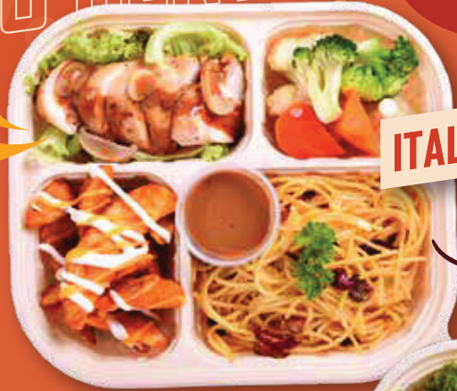
W1 ITALIAN ROASTED CHICKEN

with Spaghetti Aglio Olio, Vege-of-the-day, Wedges