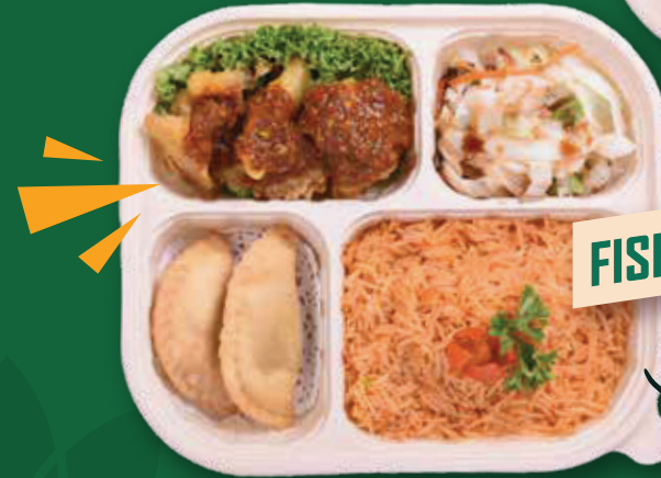
M5A FISH FILLET+SOS INDONESIA

with Nasi Tomato Basmathi, Vege-of-the-day, Curry Puff