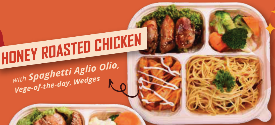
W4 HONEY ROASTED CHICKEN

with Spaghetti Aglio Olio, Vege-of-the-day, Wedges