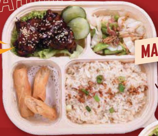
C1A MARMITE SESAME CHICKEN

with Garlic Golden Fried Rice, Vege-of-the-day, Fried Spring Roll