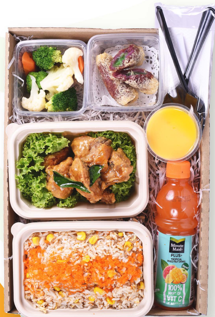
Photo reference for RM40 Premium Bento