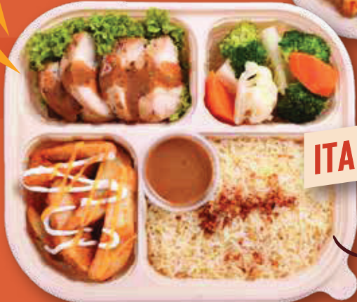
W3 ITALIAN ROASTED CHICKEN

with Italian Baked Corn Rice, Vege-of-the-day, Wedges