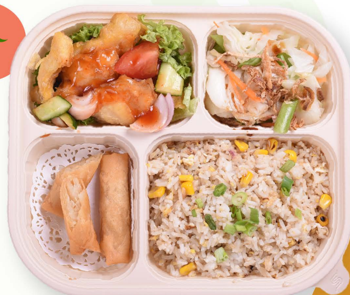
Photo reference for RM17.90 & RM21.90 Bento