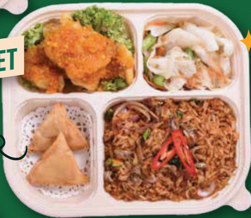
M3A FRIED BUTTER CEREAL TIGER PRAWN

with Nasi Goreng Kampung, Vege-of-the-day, Samosa