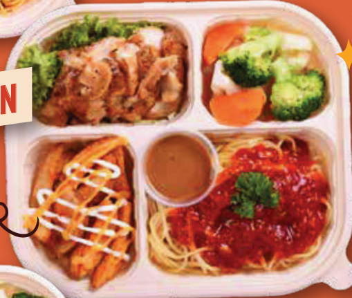
W2 ITALIAN ROASTED CHICKEN

with Spaghetti Napolitana, Vege-of-the-day, Wedges