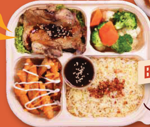
W7 BLACKPEPPER CHICKEN

with Garlic Butter Rice, Vege-of-the-day, Wedges