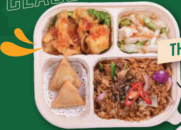
M1A THAI-STYLE FISH FILLET

with Nasi Goreng Kampung, Vege-of-the-day, Samosa