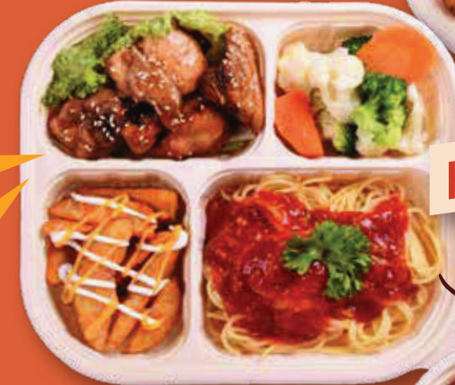
W5 HONEY ROASTED CHICKEN

with Spaghetti Aglio Olio, Vege-of-the-day, Wedges