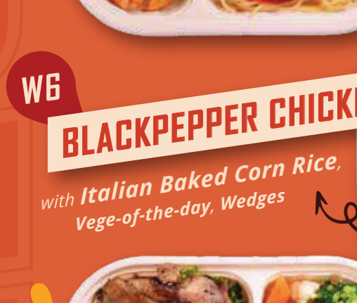
W6 BLACKPEPPER CHICKEN

with Spaghetti Napolitana, Vege-of-the-day, Wedges